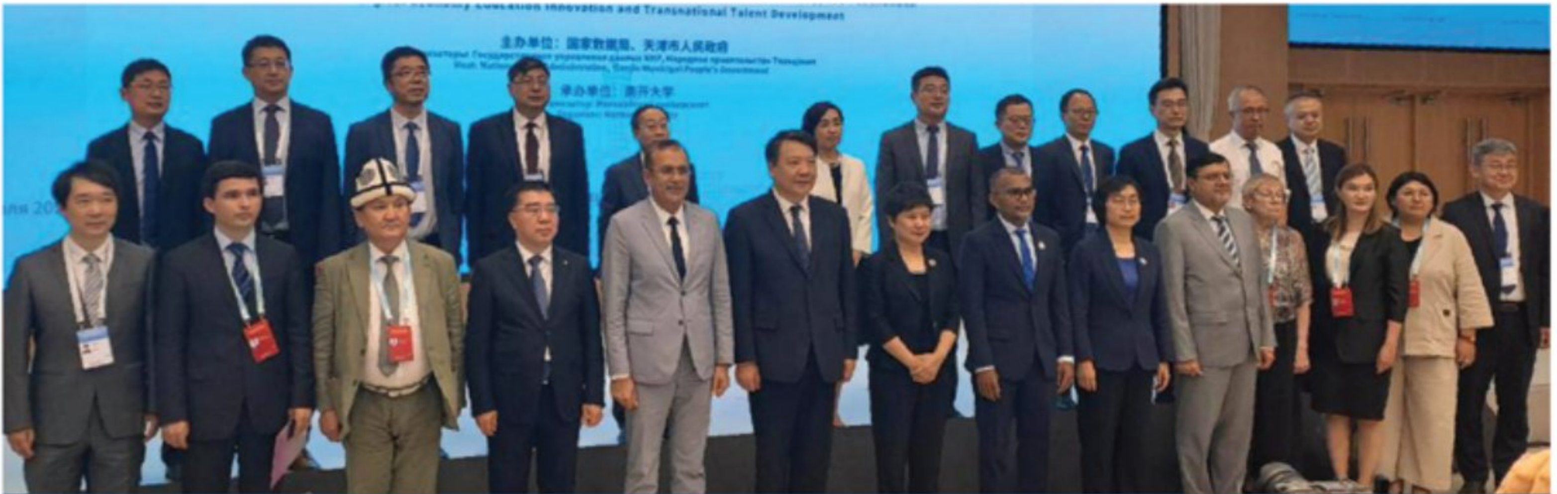
Participates as Key Panelist; Joins Launch of International Digital Economy Universities Alliance